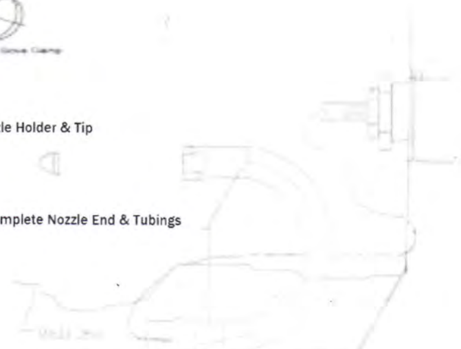
P/N 8039 Complete Nozzle End & Tubings